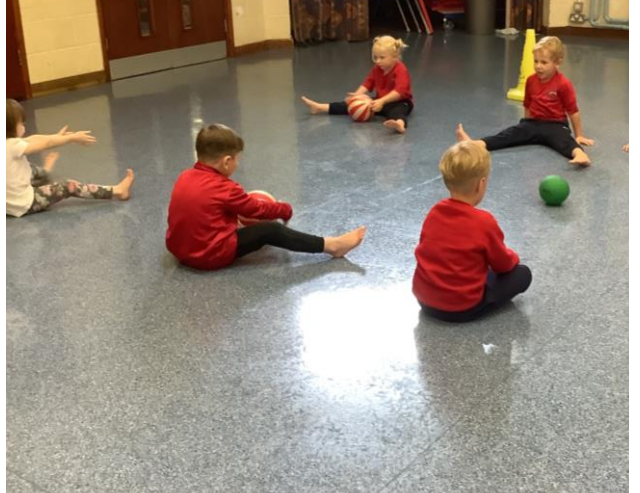
Physical Development Rolling a ball